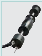
MO290-HP Moisture Hammer Probe