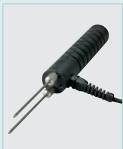
MO290-EP Moisture Extension Probe