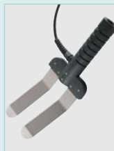
MO290-BP Moisture Baseboard Probe