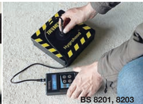
BS 8201, 8203