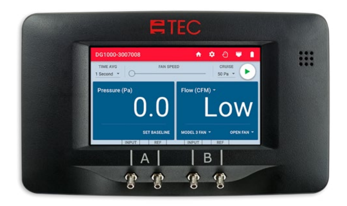
DG-1000 Pressure and Flow Gauge

The DG-1000 and DG-700 are differential pressure gauges which measure the pressure difference between either of their input pressure taps and its corresponding reference pressure tap. Both gauges have two separate