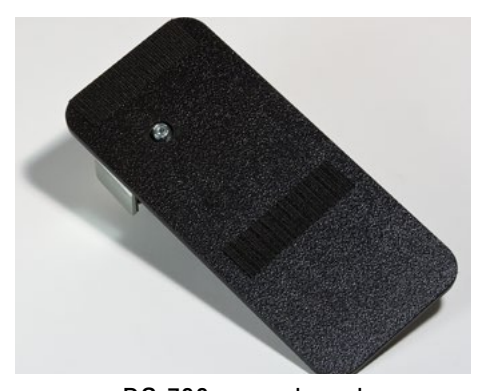
DG-700 gauge board