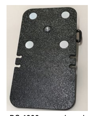
DG-1000 gauge board

measurement channels which allows you to monitor the building pressure and fan pressure (air flow) signals during the blower door test. In addition, both gauges are able to directly display air flow through the blower door fan. The digital gauge is shipped in a separate padded case which is stored in the blower door accessory case. Also included is a black mounting board to which the digital gauge can be attached using either the Velcro strips (DG-700 board) or the magnets (DG-1000 board).