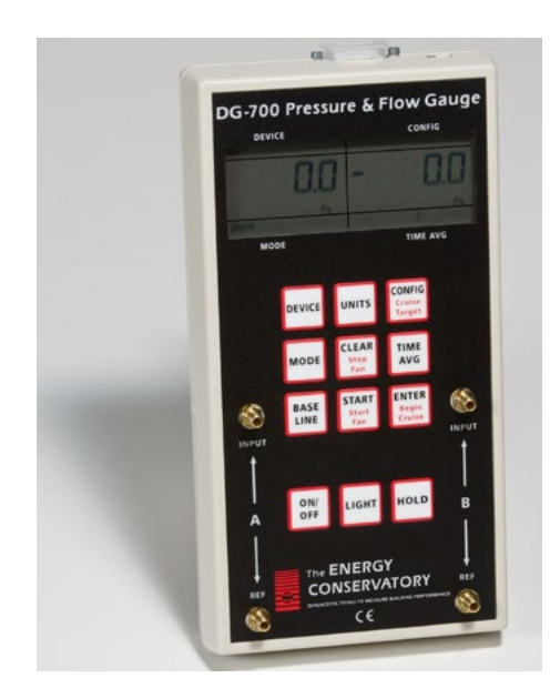
DG-700 Pressure and Flow Gauge

The DG-1000 and DG-700 are differential pressure gauges which measure the pressure difference between either of their input pressure taps and its corresponding reference pressure tap. Both gauges have two separate